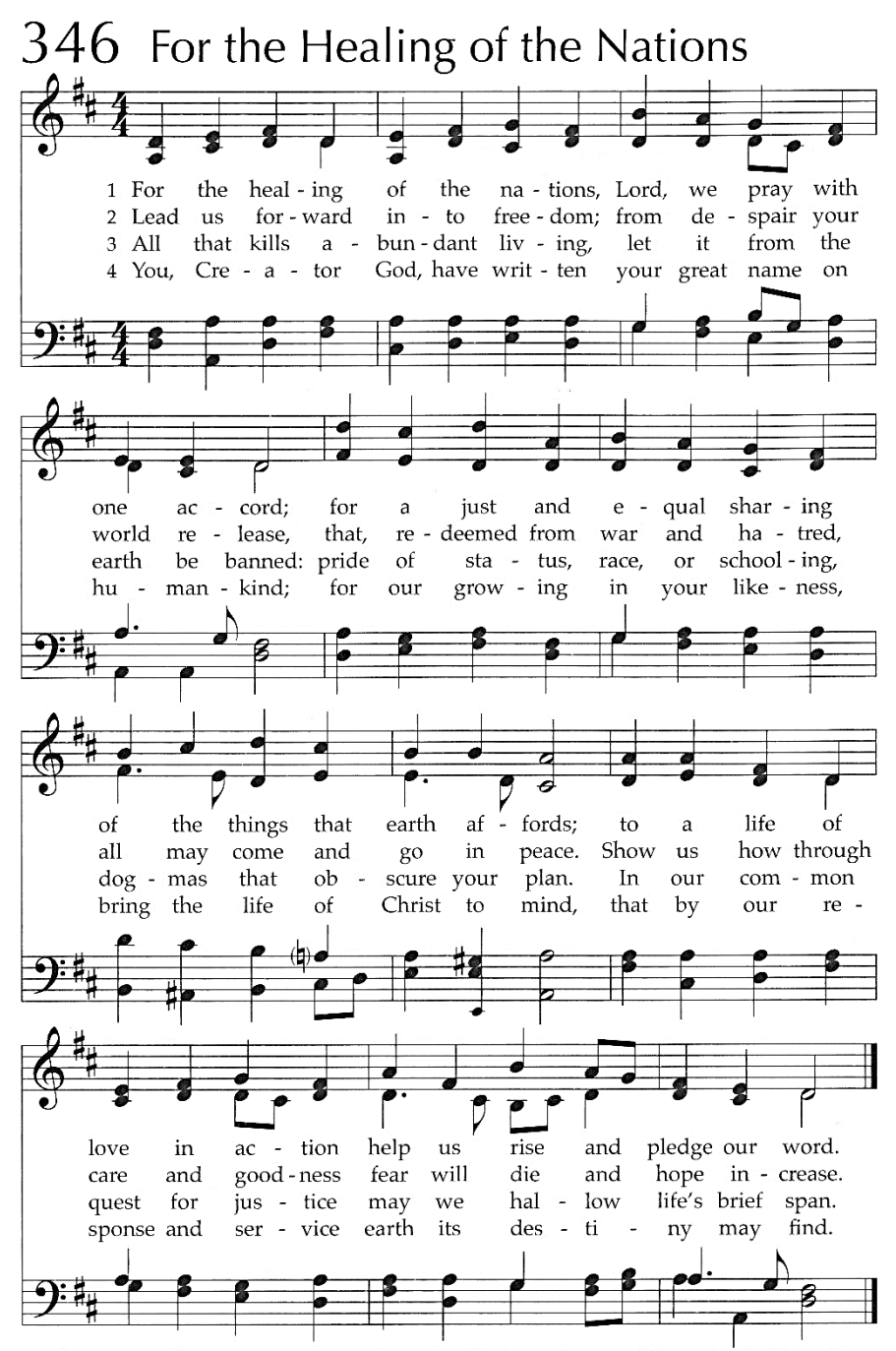
The first line of this text quotes the declared purpose of the leaves of the tree of life growing beside the river of life in the heavenly Jerusalem (Revelation 22:2). The hymn continues by identifying some of the many ways we are called to share with God in this healing work.